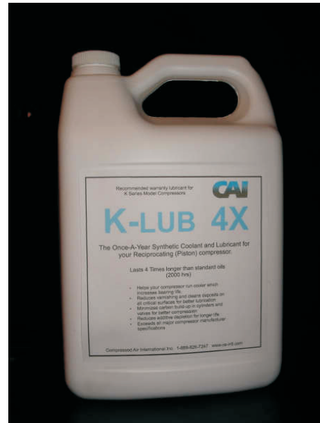
K-Lub 4X Compressor Lubricant Specially designed for your K Series Reciprocating Compressor

Guelph Location: 5477 RR#5 Hwy 6 North, Guelph, Ont. N1H 6J2 Phone: (519) 837-0450 Fax: (519) 837-0453