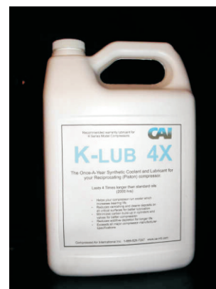
K-Lub 4X Compressor Lubricant Specially designed for your K Series Reciprocating Compressor

Guelph Location: 5477 Hwy 6 North, Guelph, Ont. N1H 6J2 Phone: (519) 837-0450 Fax: (519) 837-0453